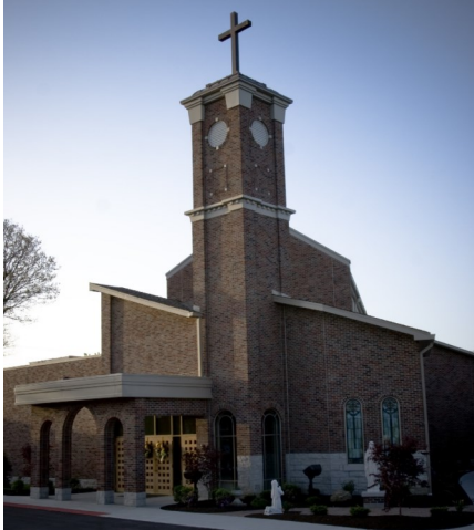
ST. ANNE 102 N. 19th St., New Castle, IN 47362 Sunday Mass at 10:00 a.m.