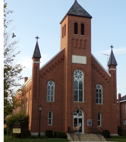
ST. ELIZABETH OF HUNGARY 333 W. Maple St., Cambridge City, IN 47327 Saturday Mass at 5:00 p.m. Sunday Mass at 8:00 a.m.

MAILING ADDRESS FOR BOTH PARISHES: 102 N. 19TH ST., NEW CASTLE, IN 47362