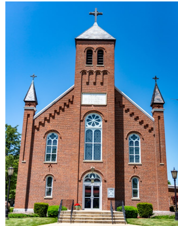
ST. ELIZABETH OF HUNGARY 333 W. Maple St., Cambridge City, IN 47327 Saturday Mass at 5:00 p.m. Sunday Mass at 8:00 a.m.

MAILING ADDRESS FOR BOTH PARISHES: 102 N. 19TH ST., NEW CASTLE, IN 47362