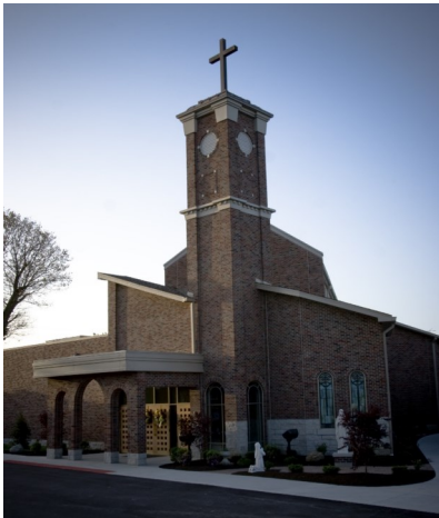
ST. ANNE 102 N. 19th St., New Castle, IN 47362 Sunday Mass at 10:00 a.m.