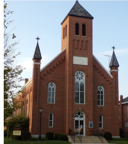
ST. ELIZABETH OF HUNGARY

333 W. Maple St., Cambridge City, IN 47327