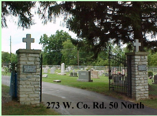
273 W. Co. Rd. 50 North

For information or to purchase plots, Please call ~ 765-529-0933