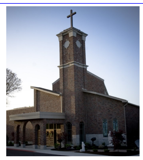
ST. ANNE 102 N. 19th St., New Castle, IN 47362 Sunday Mass at 10:00 a.m.