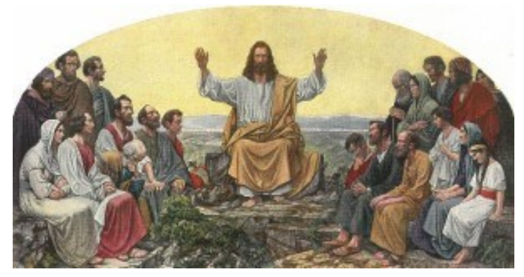
Sixth Sunday in Ordinary Time