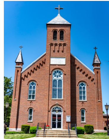
ST. ELIZABETH OF HUNGARY 333 W. Maple St., Cambridge City, IN 47327 Saturday Mass at 5:00 p.m. Sunday Mass at 8:00 a.m.

MAILING ADDRESS FOR BOTH PARISHES: 102 N. 19TH ST., NEW CASTLE, IN 47362